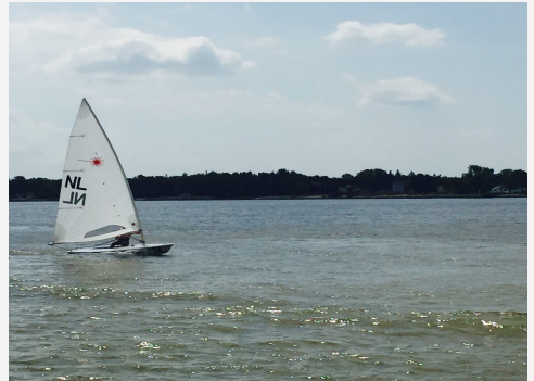
Jesse returning after a day of tough racing conditions