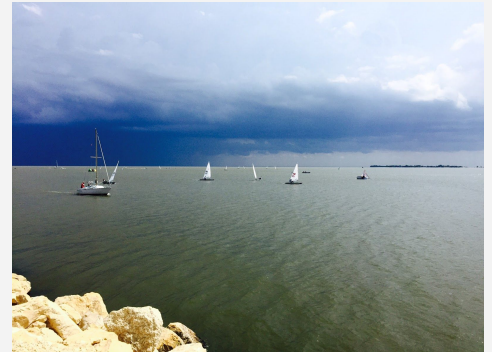
Menacing storm clouds chase sailors back to the shore